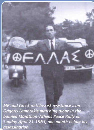
MP and Greek anti-fascist resistance icon Grigoris Lambrakis marching alone in the banned Marathon-Athens Peace Rally on Sunday April 21 1963, one month before his assassination